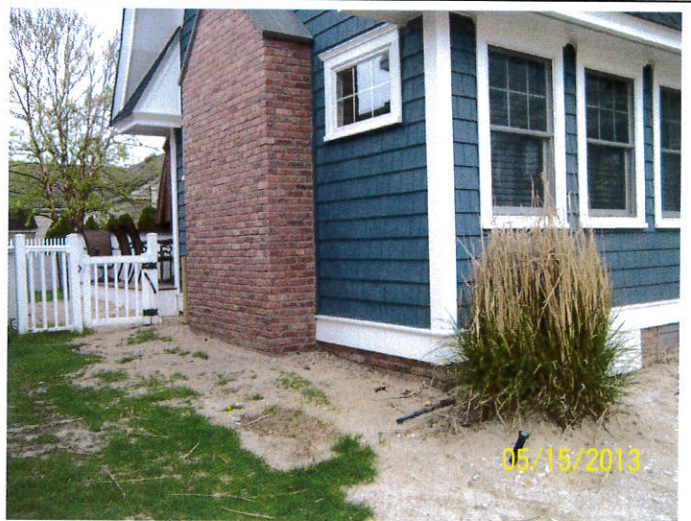
Left Side View – Date of Photograph: (See Photo Stamp)