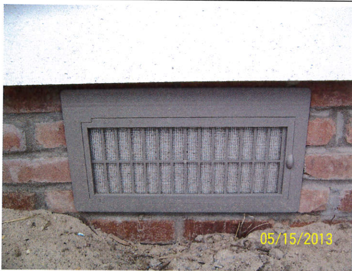
Vent View – Date of Photograph: (See Photo Stamp)