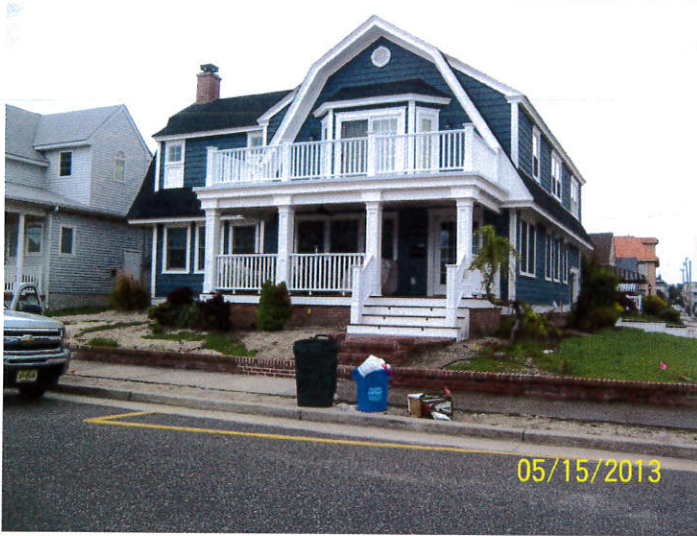
Front View – Date of Photograph: (See Photo Stamp)

If using the Elevation Certificate to obtain NFIP flood insurance, affix at least two building photographs below according to the instructions for Item A6. Identify all photographs with: date taken; "Front View" and "Rear View"; and, if required, "Right Side View" and "Left Side View." If submitting more photographs than will fit on this page, use the Continuation Page on the reverse.