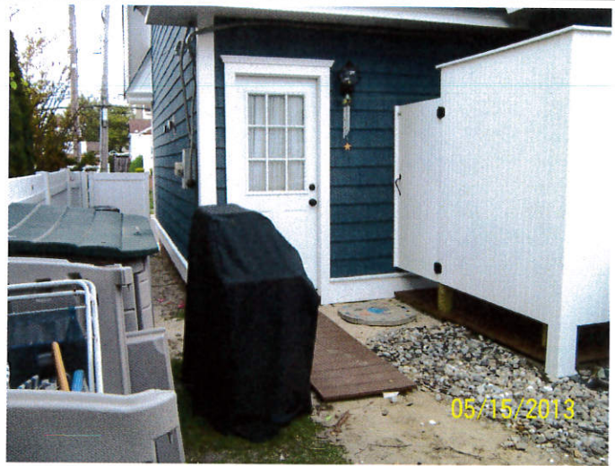
Rear View – Date of Photograph: (See Photo Stamp)